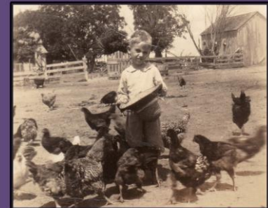
CYPRESS HISTORICAL SOCIETY 2020

Calendars can be purchased at the library for $15, or ordered through the website for $15 plus postage. If you want to send someone a Christmas gift, we can mail it directly for you. (Just like Amazon!) Thank you in advance for your continued support.