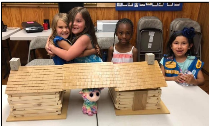
Local "Daisy" Scouts work on history projects at CHS.