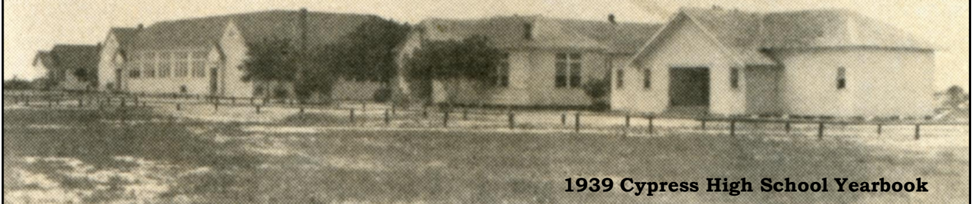
1939 Cypress High School Yearbook

After it was consolidated into the Big Cypress school in 1934, the Fuchs School building was moved to the southwest corner of Telge Rd and Cypress-North Houston Rd. (Photo looking southwest)