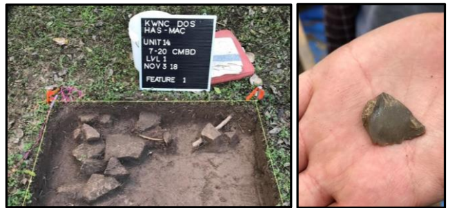
The highlight of the "Digging Old Stuff" day at Kleb Woods was finding chert flakes from stone tools.