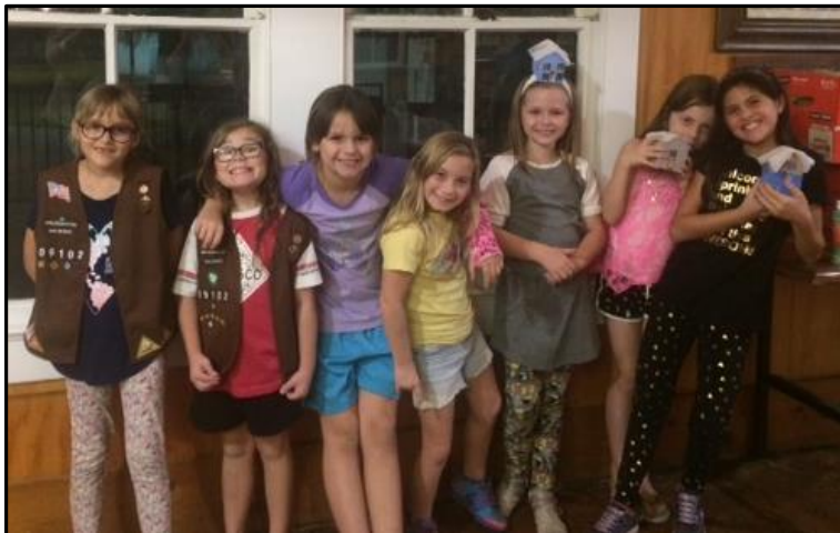
The enthusiastic girls from Fairfield Troop 109087!