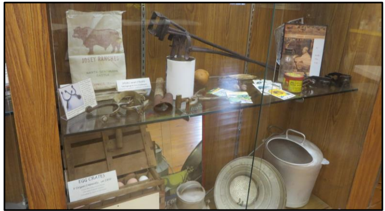
One of our newest display shelves has been our Ranching artifacts, including branding irons, spurs, and a de-horner.