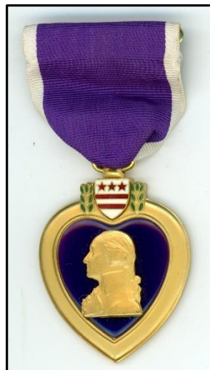
The "Lost" Purple Heart