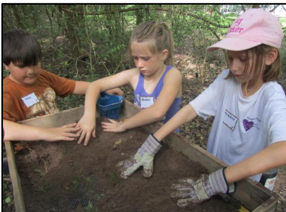
Archeology dig at last year's History Camp!

The Cypress Historical Society will once again be offering their "Hands-on History" Camp hosted by Cypress Top Historic Park and Kleb Woods Nature Center/Heritage Farm. The program will be offered the week of June 25th-29th from 9:00 am- 2:30 pm. Youngsters going into grades 4-6 are eligible for this unique experience. Campers will be exploring early crafts, blacksmithing, digging and exploring artifacts, interviewing seniors, creating family trees, interpreting photos, creating museum models and exhibits, viewing maps, discovering early schools, giving tours and preparing museum exhibits. They will be spending their time at Cypress Top Historic Park and at Kleb Woods Nature Center & Heritage Farm working with the Houston Archeological Society and local blacksmiths. The cost is free to CHS family members, or others may join CHS ($25-Fam) to attend. If you have a child or grandchild who is interested, contact us immediately, as there are only a few spots left.