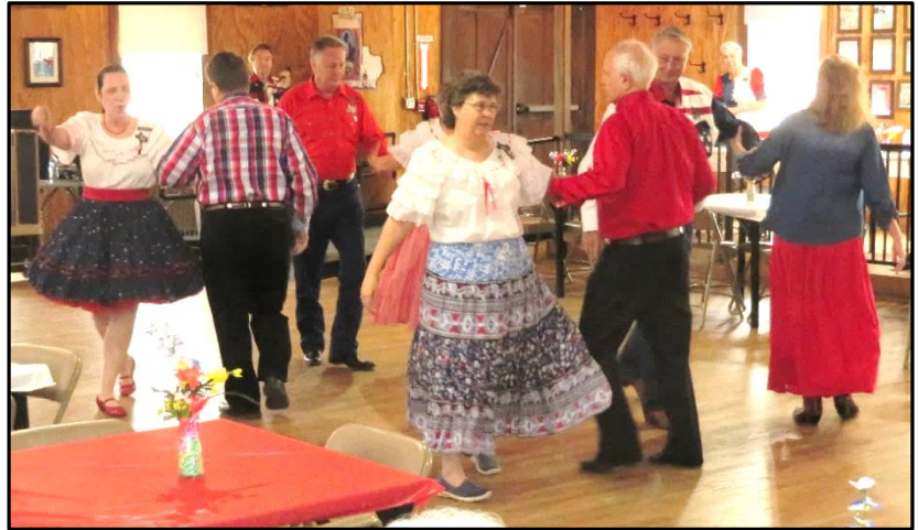
The "Hey Lollies" entertained with their square dancing routines.

We are looking forward to seeing all of you at our annual meeting in October. However, you know you are welcome to any of the board meetings we have monthly. Stop in, and help us improve our programs.