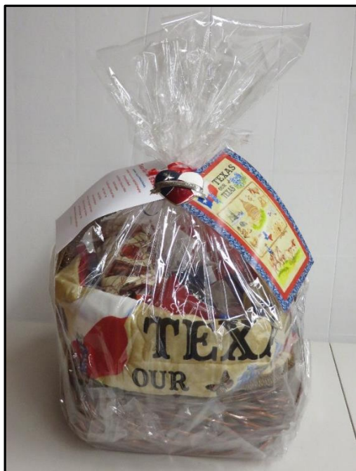
"Texas Our Texas" basket donated by CHS for the auction at the Rosehill Social BBQ.