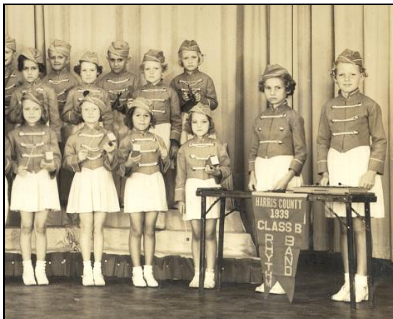
A portion of the Fairbanks 1939 Rhythm Band photo. The full photo can be seen at the CHS Library, and we need help to get all the names recorded. The children are precious!