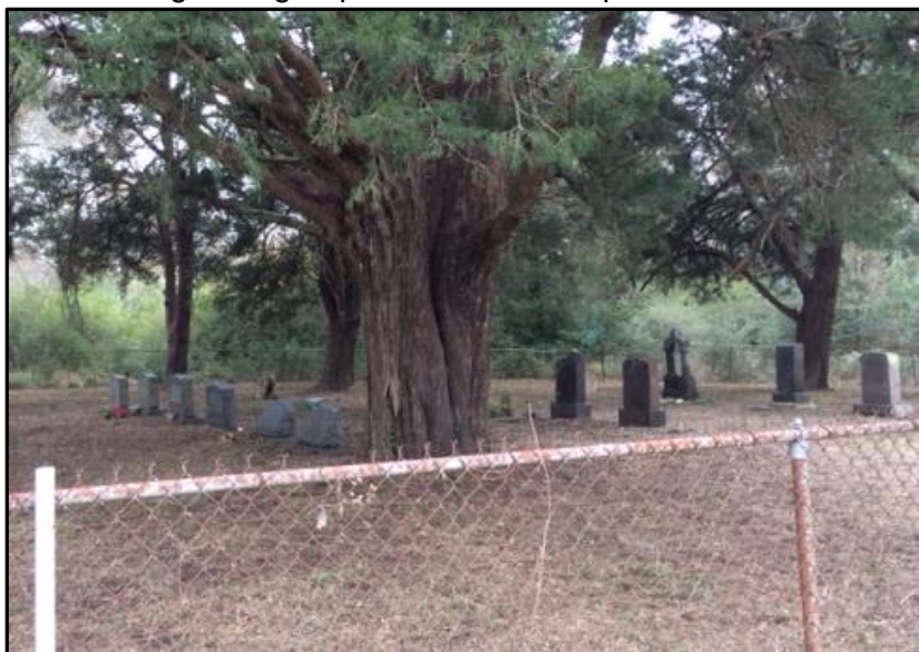
The finished product speaks for itself! Great job, Nate.