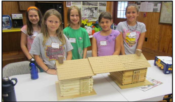
Building a "dog-trot" cabin was a favorite craft at camp.