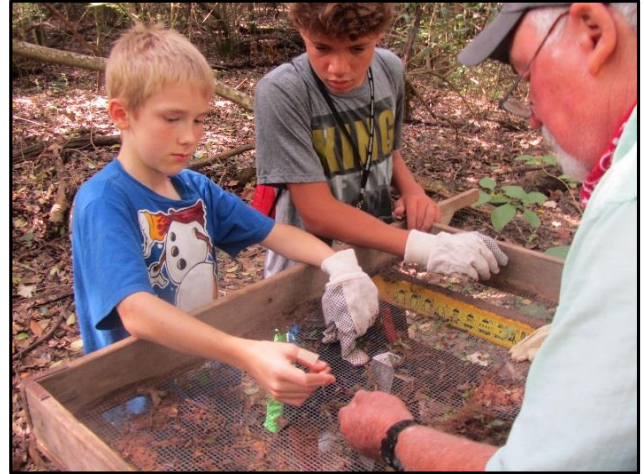
Artifacts were found by sifting the dirt at Kleb Woods.

Hours: Tue, Wed, Thur 9 - 4, & 3 rd Sat 11 - 2