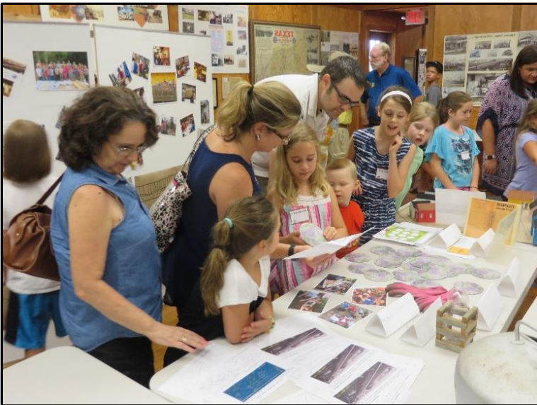
The culmination of camp was Friday afternoon, when campers acted as docents and explained Cypress history to their parents!