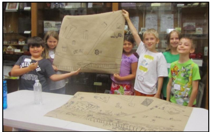
Vintage photos were used to draw a map of 1907 Cypress.