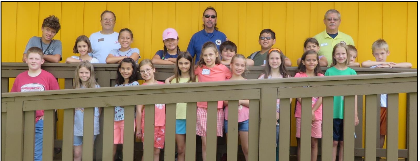
The 2017 “Hands On” History Day Camp, offered through the Cypress Historical Society and Harris County Pct 3 Parks.