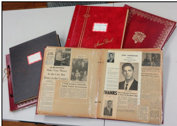
The Cy-Fair H.S. scrapbooks, dating back to the 1940's, document the lives and achievements of Bobcat students including awards, weddings, school events, and deaths.

On November 13, a graphic designer contacted the Cypress Historical Society asking if we could provide her with some vintage photos of Cypress, Texas. She was working with a new Fiesta Mart on Hwy. 529 to display vintage photos in their store. The pictures will be enlarged to 3' x 4' and will be installed in the entrance of the new store. We have worked with other businesses and groups in the past including Cypress Breakfast House, Cy-Fair ISD, Wells Fargo Bank, Raising Cane's, Lone Star College-Cypress, and Applebee's. These public displays help promote the rich history of this area.