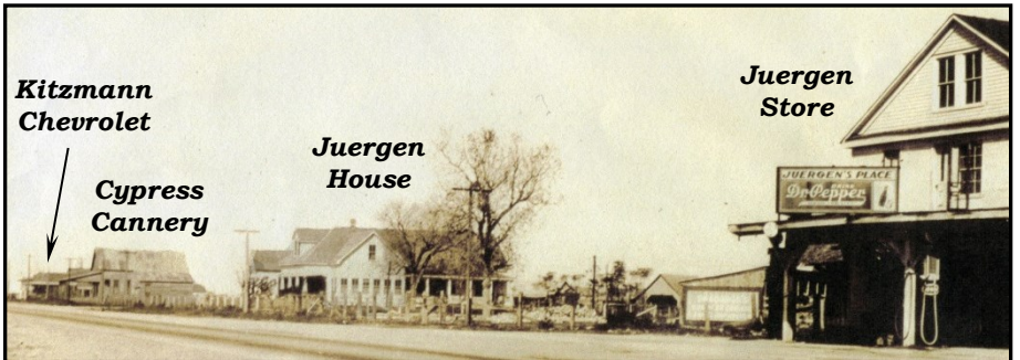
This late 1920's photo shows the Cypress Cannery on Hempstead Hwy.