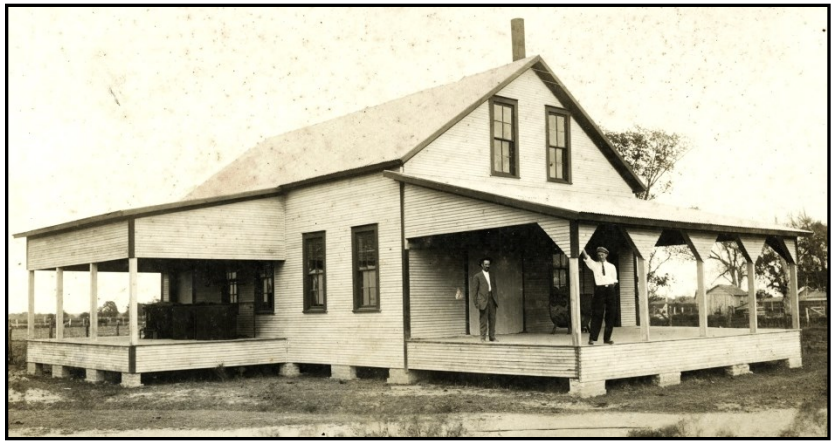
(Above) The Cypress Cannery building. (Below Left) The list of original Co-Op owners.