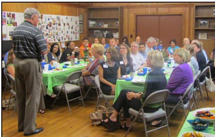
The Cypress Historical Society hosted the August meeting for our fellow Cy-Fair Chamber Of Commerce members.

Needless to say, visitors to Cypress Top Park arrive with many different needs and expectations.