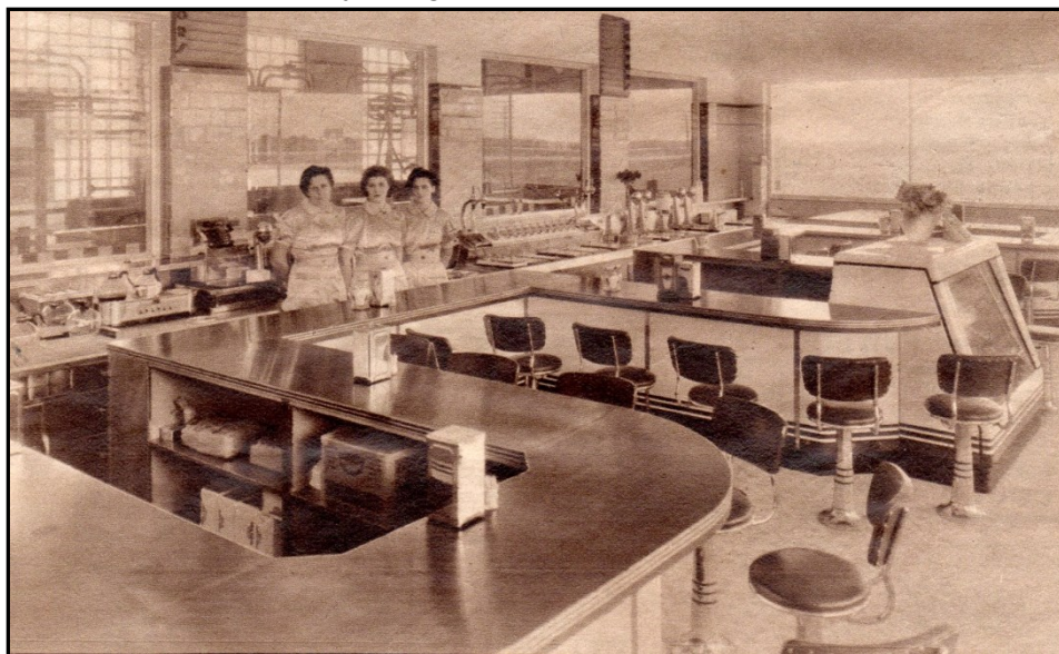
Many area folks have fond memories of enjoying an ice cream cone at the F&M Ice Cream parlor on Hempstead Highway.