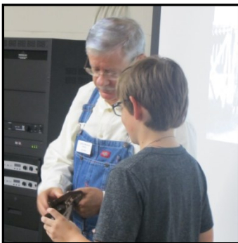
Working with artifacts up close is a key to learning.

historic slide show about the history of Cypress developed by Jim Sigmund which included maps, documents, and photographs. The students then worked with actual artifacts taken from the Cypress Historical Society collection. Students examined a set of artifacts and interpreted a photograph showing the artifacts being used by a local farmer. The final part of the presentation had the students explore the history of the area where their school is located. This included a look at the Josey Ranch for Smith students and the Nine Bar Ranch for Salyards students. The students and their teachers were commended for their continuing interest in Cypress history. Next year, working with the Cy-Fair Council for the Social Studies, we plan to expand these presentations to additional schools in the area.