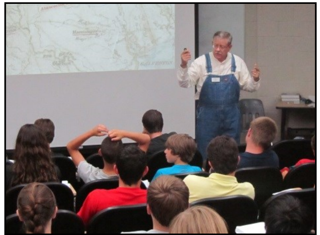
Salyards Middle School students learn that Cypress was an important crossroads as early as 1836.