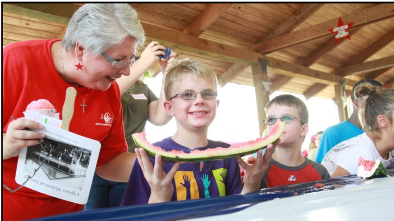
The proud winner of our “Hands-Free” Watermelon Eatin’ Contest!

While the activities and food were enjoyable, the best part of the picnic is always the reunion of friends who grew up in the Cypress area, and the opportunity to share the history of Cypress with the new residents of this rapidly growing area of Harris County.