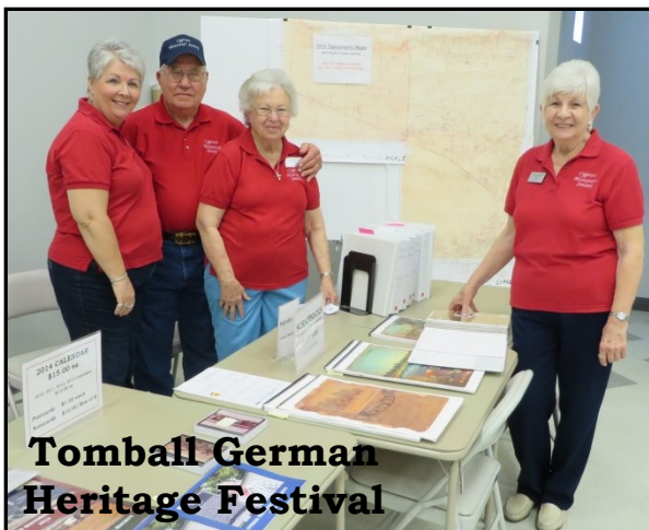
Tomball German Heritage Festival