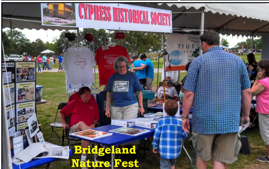
Bridgeland Nature Fest

Members of CHS have been busy the last few months giving presentations to various groups and attending local events to promote Cypress history and CHS. The Cy-Fair Chapter of Network Texas, the Discover Cy-Fair Committee of the Cy-Fair Chamber of Commerce, and the Cypress Chapter of the National Archive and Retired Federal Employees have hosted presentations. Members have also manned a CHS booth at the Tomball German Heritage Festival and the Bridgeland Nature Fest, and made a contribution to the Rosehill Social Club. These have all been opportunities for CHS to promote our local history and organization. If you know of a group that would be interested in a presentation or of a local event where we can have a booth, please contact the office. As more people in our community are made aware of CHS through our speakers and information booths, we can gain members and support.