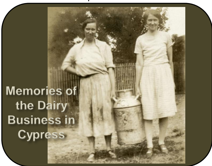
Memories of the Dairy Business in Cypress