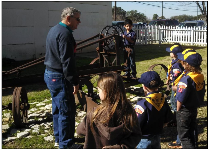
The Pack 27 Cubs studied the early road grader in the Cypress Top Park, to discover how each of the mechanical controls worked the machine. Of course, each boy got a turn in the driver's seat!

After eating lunch outside under the pavilion, the Den performed a service project by picking up litter throughout the Park. It was a great visit for the Scouts and the parents, and I think they all came away with a greater understanding of the history of the area.