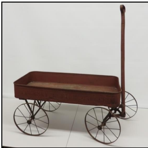
Marvin Weiman's "Little Red Wagon"