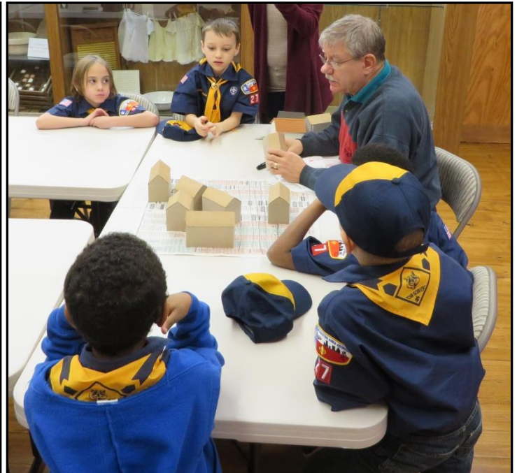
Looking at the 1907 aerial picture of Cypress, The boys found the various buildings, and noted their position relative to the road and RR tracks. Using models of the various buildings, Jay guided the scouts to draw a map of early Cypress, where each boy got to place his building in the proper location.