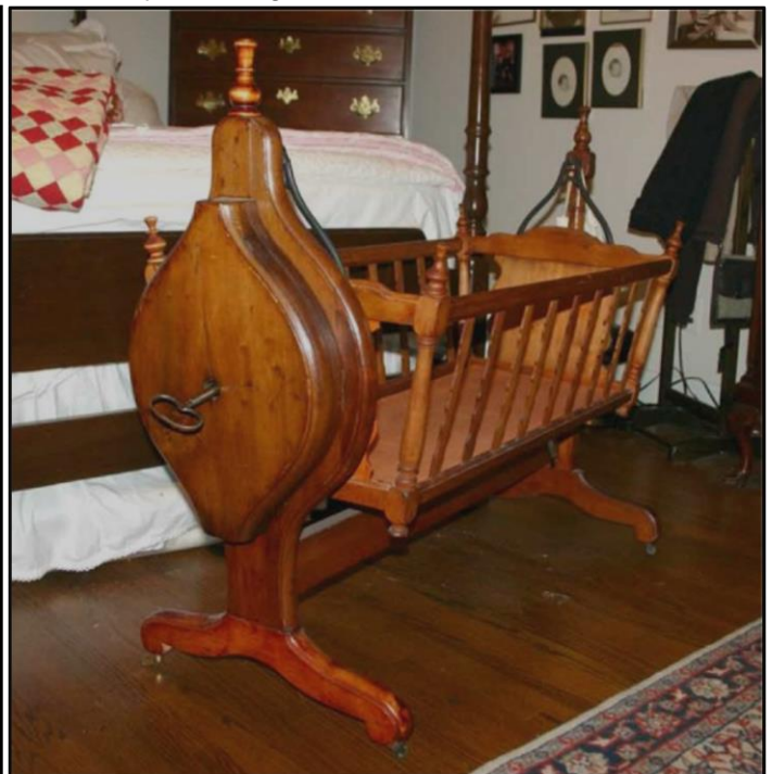
A near-identical cradle was found on the Internet, showing the wind-up key for the watch-type spring mechanism.