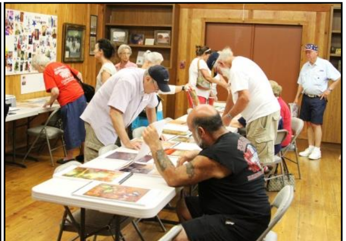
The Thelma Dopslauf Scrapbooks and cold A/C kept the Darline Roth Research Library packed during the picnic!