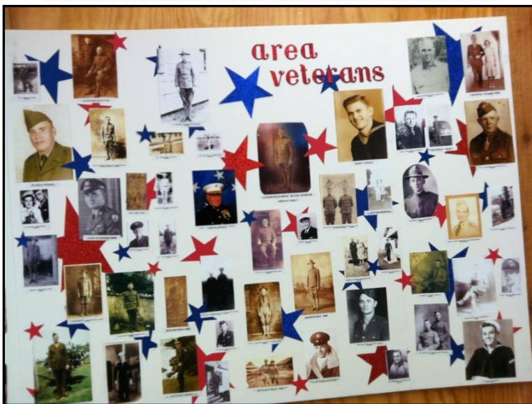
We have filled up our first display board of Cypress area Veterans, and are working on another. Stop by and check it out!