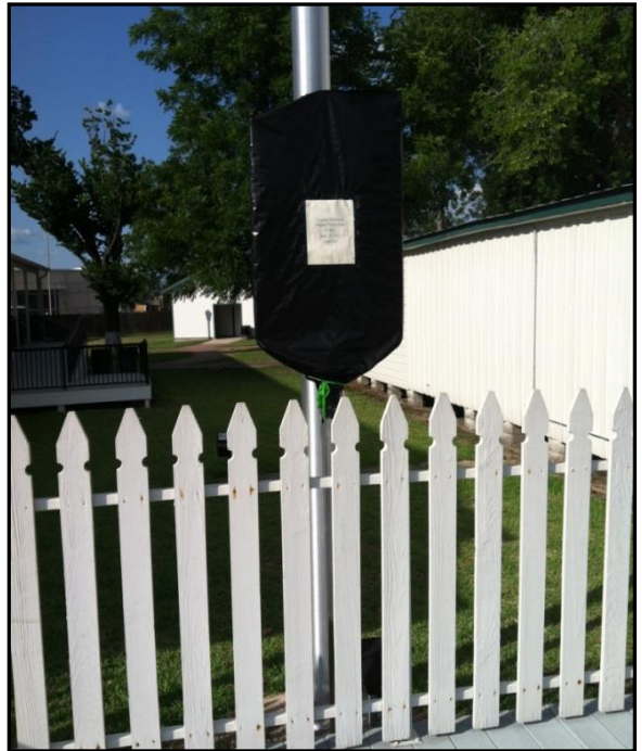
Don't miss the "unveiling" of the Cypress community historical marker on June 14 th !