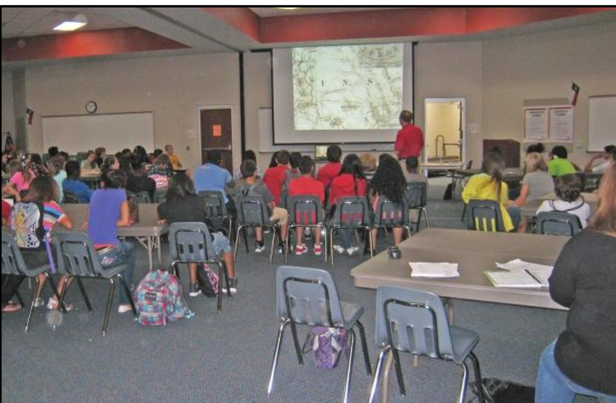
We presented to six classes and close to 500 Texas History students!