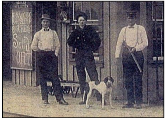
A railroad dolly like the recent donation can be seen in the background of the 1907 Cypress Depot picture.