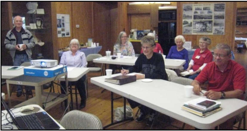
Participants in the "How to Research Your Family History" class learned some new methods for genealogy research, and shared ideas.