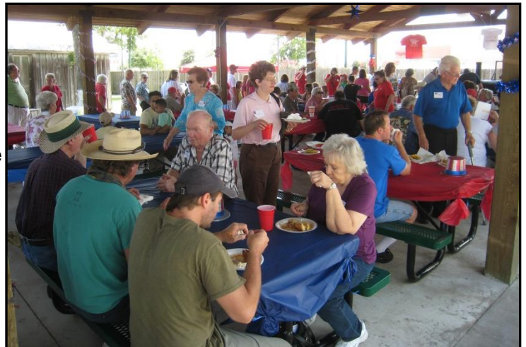
The CHS Picnic is a time for food, fun, and seeing old friends!

It's time again to start planning for our 2013 "Old Fashioned" Picnic, to be held on July 6 th at Cypress Top Historic Park. The picnic gets bigger every year (over 400 members and guests last year!) and we are always looking for new activities to add. If you would like to help out, or have an idea for a vintage craft, kid's activity, or anything that would be of interest to our membership, please give us a call. We are not permitted to sell food or goods, so all services must be donated and items free. Our community picnic sponsors have helped to keep this a free event! If you, or your company, would like to sponsor a booth, or donate food items, that would be a great help.