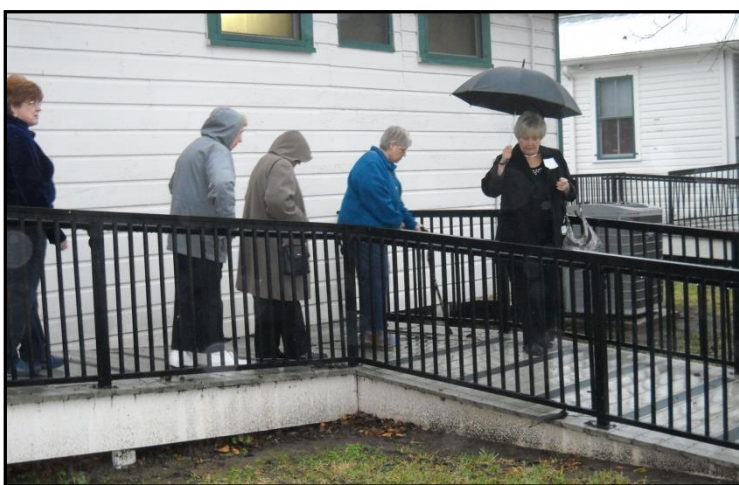
A little thunderstorm did not deter the members of the Lakewood Methodist Senior Tour from seeing Cypress Top!