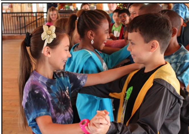
What better place than the Juergen's Dance Hall to learn a few new dance steps!