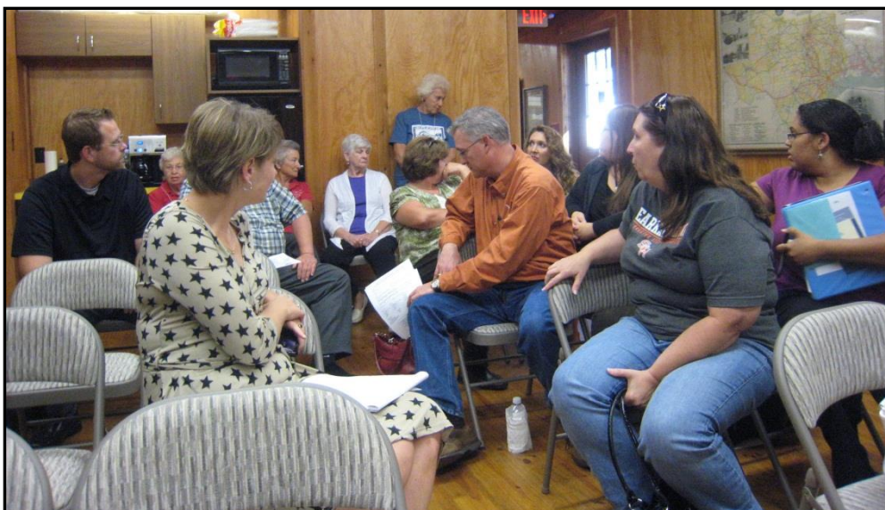
The CHS presentation was followed by a question and answer discussion. Between the CHS members and the Social Studies Council members, we had a wealth of history knowledge in the room!