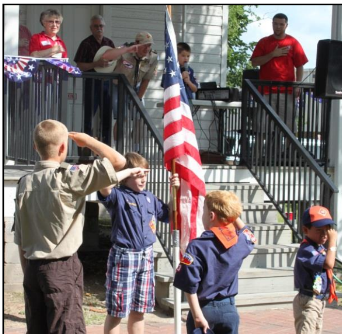
Cub Scouts from Pack 3 opened the day with the posting of the colors and the Pledge of Allegiance.

By all accounts, it was another great picnic! We could not have done it without the many members who help to make this happen, and especially an outstanding group of Sponsors who help to keep this a free event: Minuteman Northwest Press, Daniel Arizpe Photography, Reddy Ice, Prosperity Bank-Cypress, HABU Graphic Designs, HEB-Cypress, Arthur Murray Dance Studio-Cypress, Cy-Fair Back & Neck Clinic, Wal-Mart Supercenter-Cypress, Raising Cane's Chicken, Topper Stamps, Special T's Shirts and More, Cypress Station Grill, and Home Depot-Cypress. Please thank them for supporting the Cypress Historical Society.