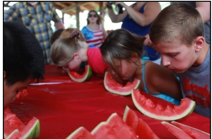
The Watermelon-Eating Contest was a popular event at this year's Picnic. The cheering crowd got into it as much as the participants!

Hours: Tue, Wed, Thur 9-4, & 3 rd Sat 1-4