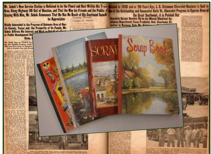
One of our new additions are a collection of Newspaper Clipping scrap books, brought in by Thelma Backen Dopslauf. These books contain articles from the Cypress-Addicks area from the 1940's through the 1970's!