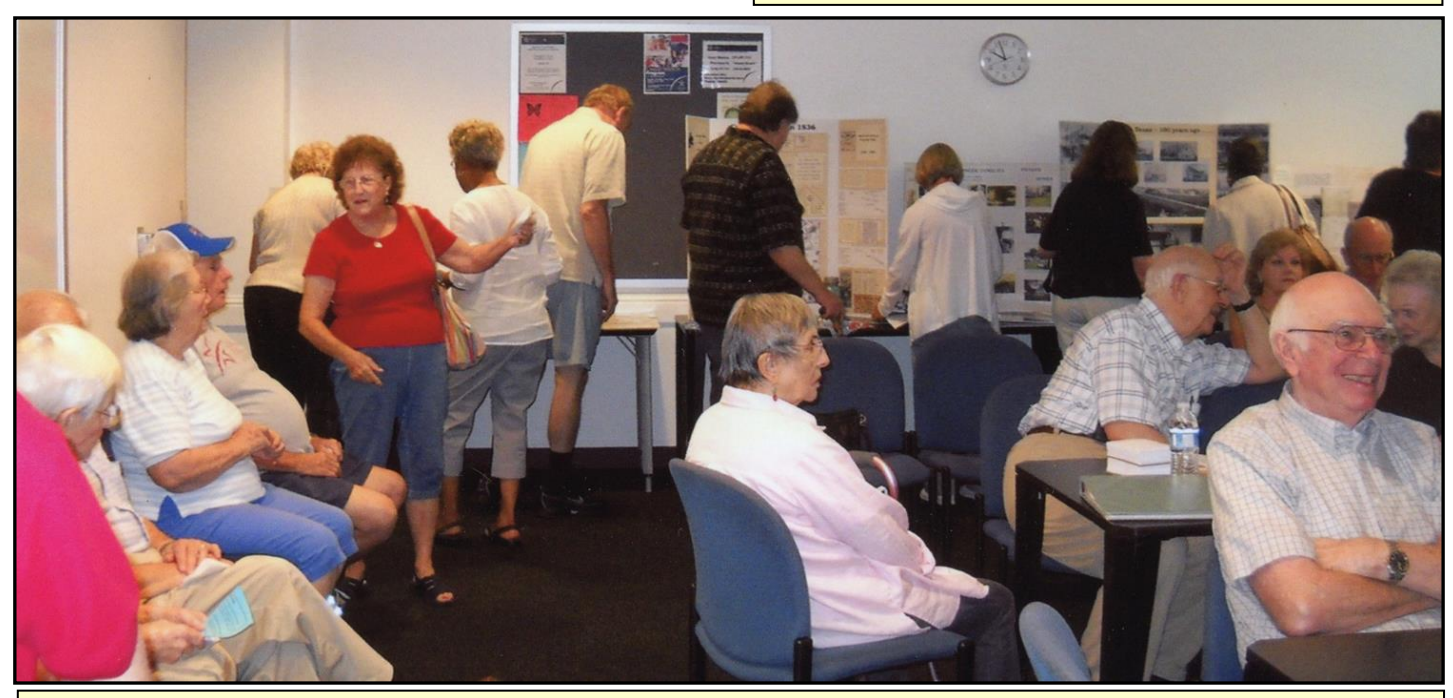
CHS presents the history of Cypress to a packed house at the Academy of Lifetime Learning at Lone Star College Library!