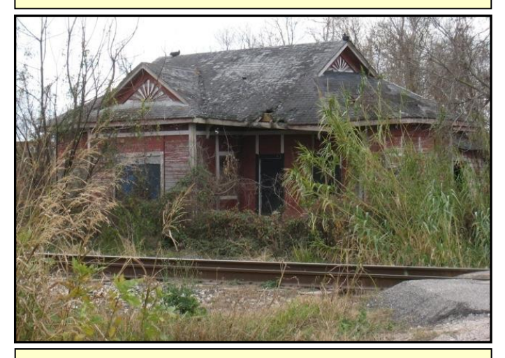
Still standing today, the Satsuma R.R. Section House, now used as a spooky attraction for the Phobia Haunted House.