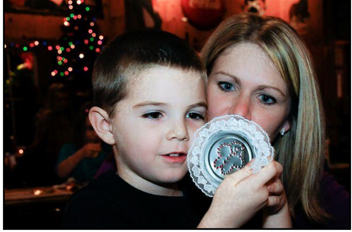
Children can make beautiful ornaments to decorate the Cypress Top tree ,donated by the Cypress Historical Society!

Contact Terri Sigmund (281) 373-9052 or JSigm@aol.com